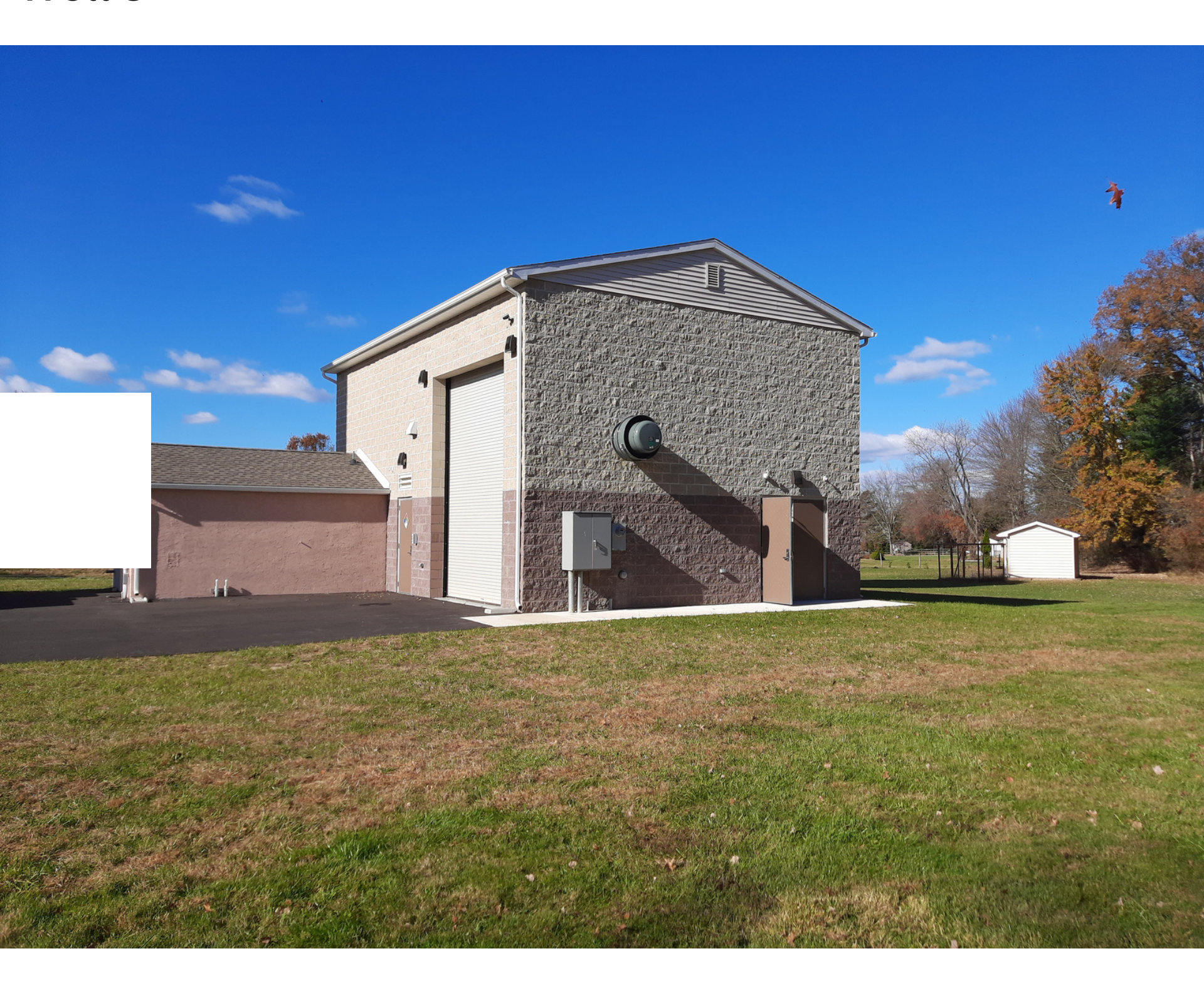
Building that houses filtration units for Well 8.