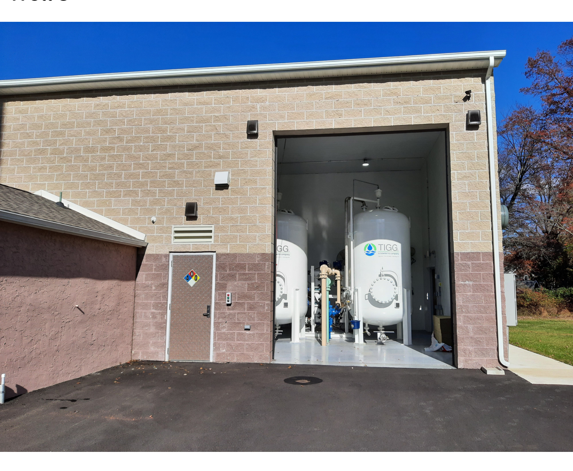
Main treatment and polishing units for Well 8.