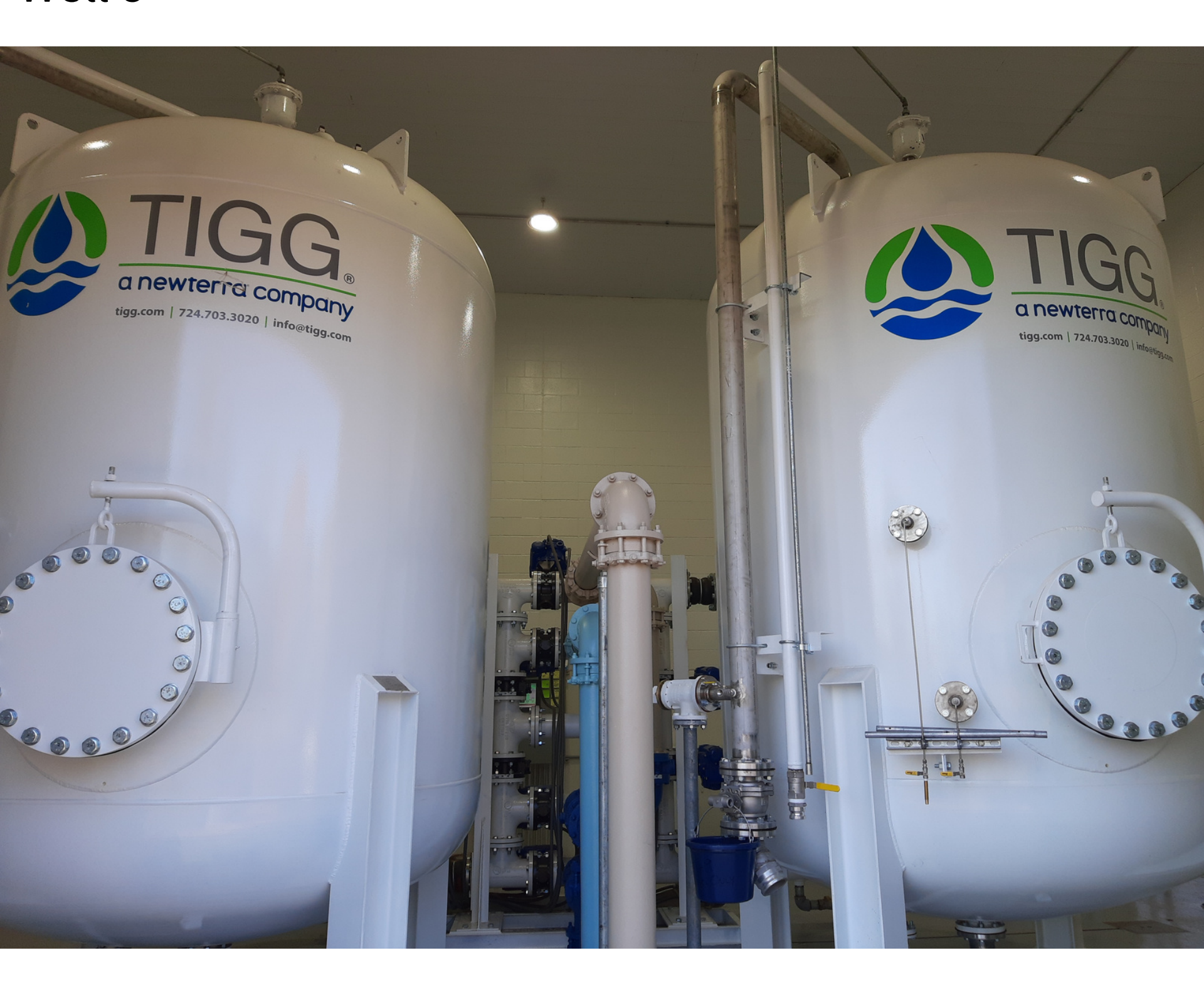
Main treatment and polishing units for Well 9.