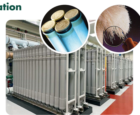
system consists of millions of hollow tube Membrane filtration is one of Forest Park Water's most notable features and is considered the filtration technology of the future.

Membrane filtration is a more effective barrier than traditional media filters against the passage of microscopic particles, including potentially harmful pathogens. The entire membrane system consists of