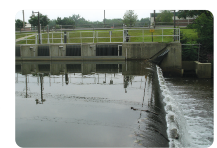
Inflatable Rubber Dam

The intake is comprised of an inflatable rubber dam and steel bar racks. The dam creates a water pool that allows water to flow by gravity through the bar rack intake and into the raw water