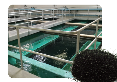
Granular Activated Carbon, or GAC, Contactors remove trace amounts of undesirable compounds.

The ozonated water gets pumped to granular activated carbon contactors where trace amounts of undesirable organic and chemical compounds are removed by adsorptive and biological mechanisms. This occurs as the water