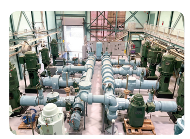
The pump room helps deliver clean, safe water to NPWA and NWWA customers.

Finished water flows through massive pumps for delivery to each authority's distribution